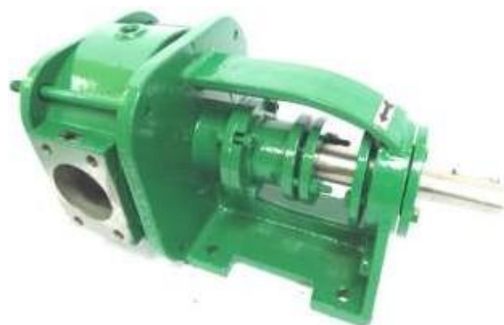
INTERNAL GEAR PUMP