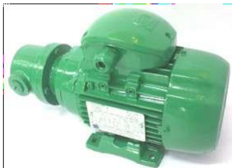
ROTARY TROCHOIDAL PUMP